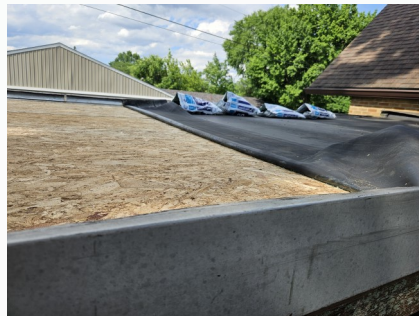
Half Way Done