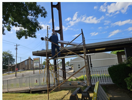
Large roll— going up!