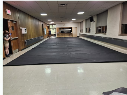
One large sheet of rubber!!!