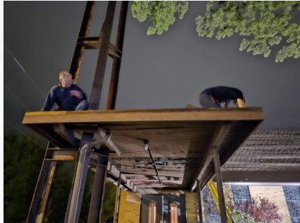
The Evening Shift

A special thank you to my family for putting in many hours of front porch roof repair!!!