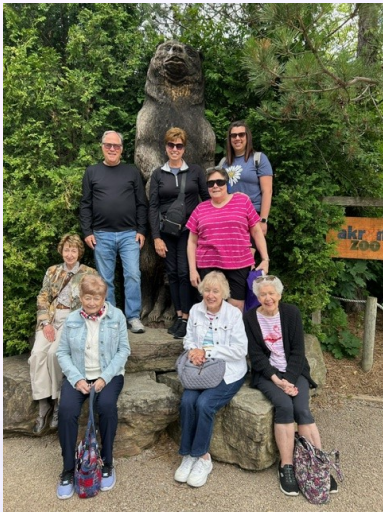
What a Good Looking Group!