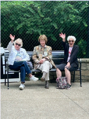
Having a Great Time! Wish You Were Here!