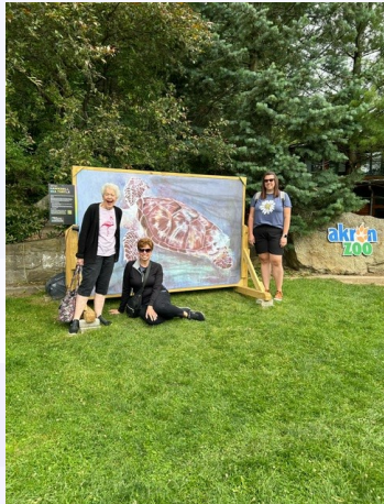
Check Out This Giant Turtle!