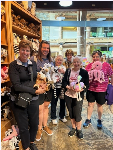
Yes, Ladies! These are the ONLY animals you can take with you!