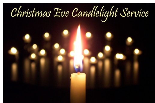
Christmas Eve Candlelight Service